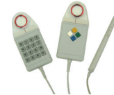
DrawingBoard VI digitizers work with a variety of cursors and stylus pens